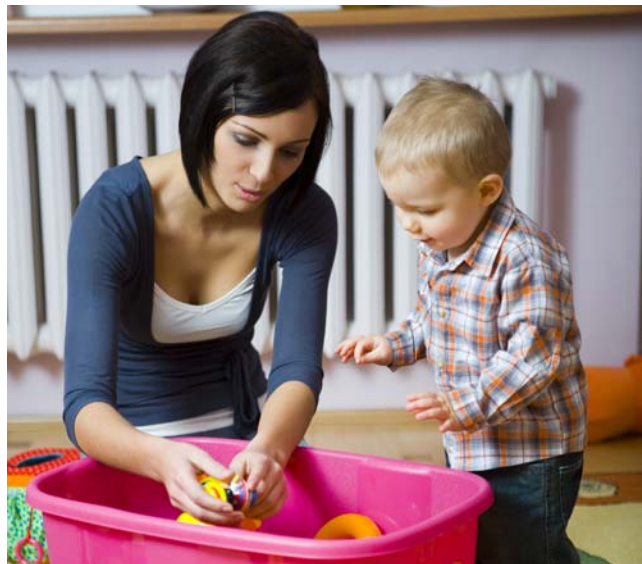
Floortime™ is a trademark of the Interdisciplinary Council on Developmental and Learning Disorders, Inc.